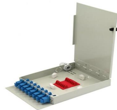
Din-Rail Mount Termination Box