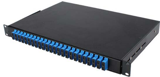
19" Patch Panel upto 48F

AFOC fiber optic patch panel (FOPP) Series are used to terminate network or equipment cables for FTTH, WAN & Industrial Networks. The patch panel connects fibers coming from one or several network cables to connectors.